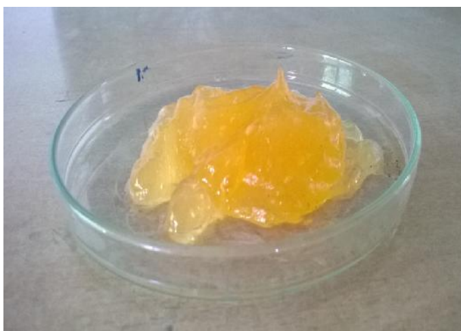
Figure-2: Topical gel of Kalonji seeds ( Nigella Sativa )

The gel was yellowish transparent in appearance.