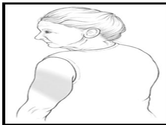
Figure no 2. Subcutaneous route

Subcutaneous injections are administered into the fatty tissue found below the dermis and above muscle tissue. It is that recommended subcutaneous sites for vaccine administration are the thigh (for infants younger than 12 months of age) and the upper outer triceps of the arm (for persons 12 months of age and older). If necessary, the upper outer triceps area can be used to administer subcutaneous injections to infants. Needle Gauge & Length - 5/8-inch, 23- to 25-gauge needle.