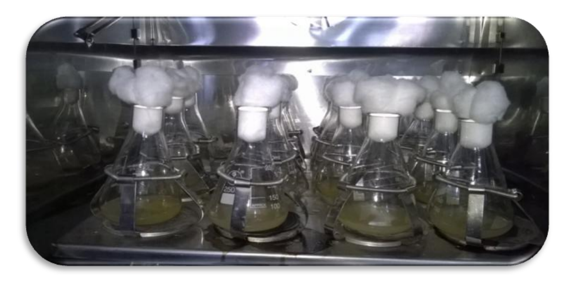
Figure 3: Degradation of Pre Treated Polyethene