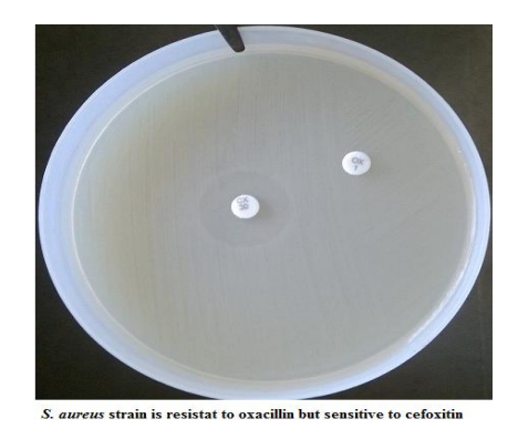
Figure 1: CxDD and OxDD test for MRSA

PPV-Positive predictive value, NPV- Negative predictive value, Ox DD- Oxacilline disc diffusion, CxDD-Cefoxitin disc diffusion, OSA- Oxacillin screen agar.